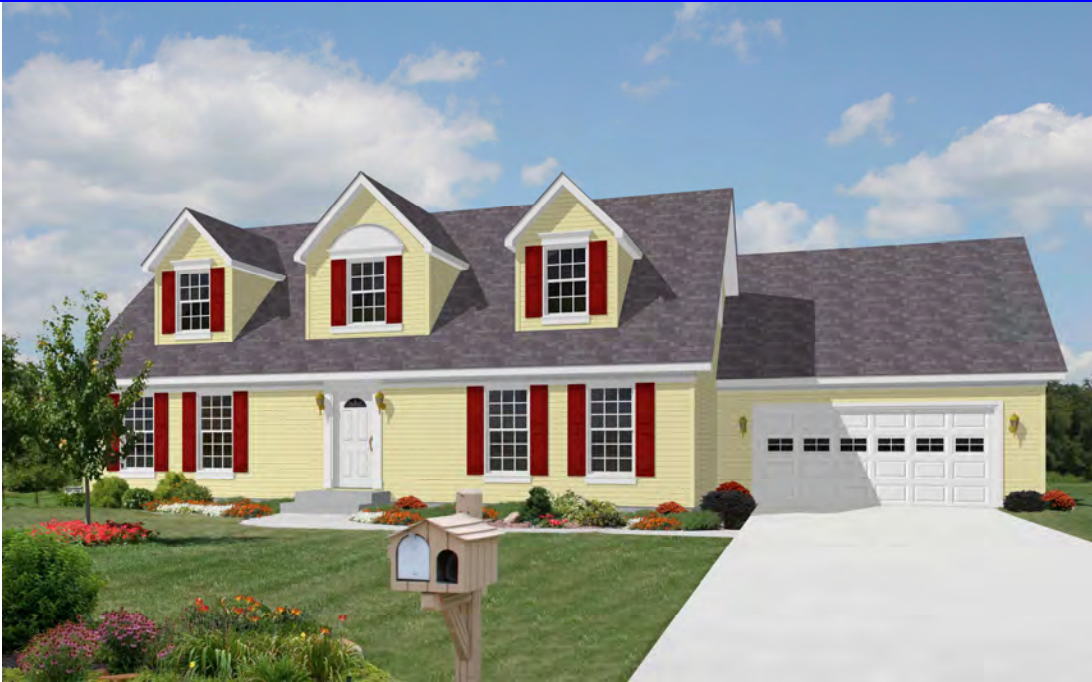
Shown with optional and/or site built features