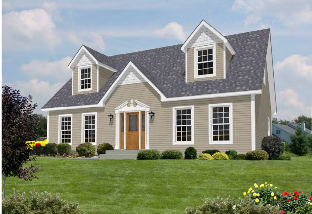
Shown with optional and/or site built features