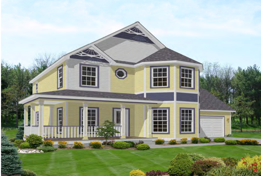
Shown with optional and/or site built features